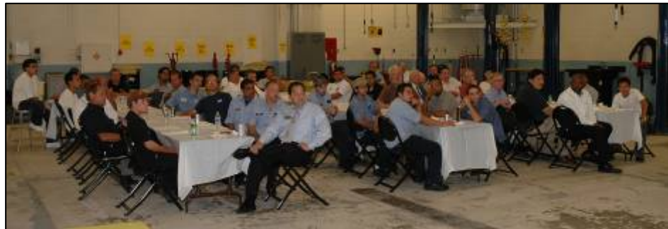
ADEI students, mentors and sponsors at the fall orientation at Montgomery College

with an interest in automotive repair careers in the automobile retailing industry.